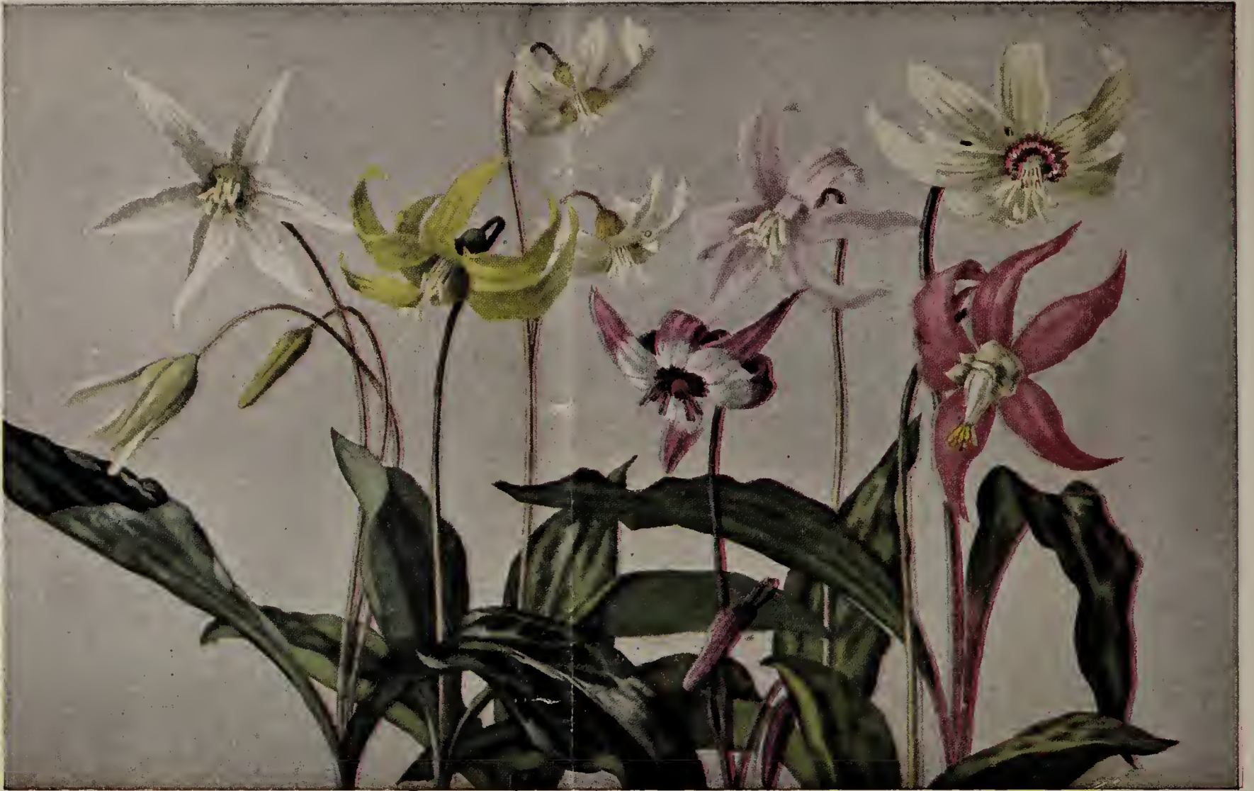
The delicate tints of Erythroniums make them one of the most charming plants in a garden. The varieties here illustrated are: Giganteum , Grandiflorum robustum , Citrinum , Hendersonii , Revolutum Pink Beauty , Californicum White Beauty , Johnsonii . (See pages 8 and 9.)